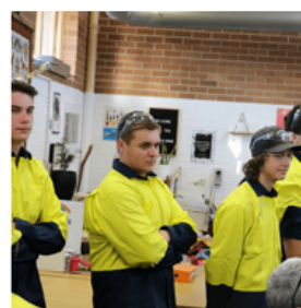
Photo: National Skills Week Launch in NSW. RTOs working together. TAFE NSW showcasing their products and Pacific Training College students assisting with event managing the celebration.