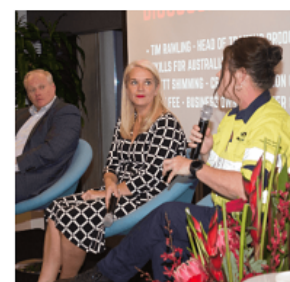
Photo: Kurri Kurri High School careers Day 2019 during National Skills Week.