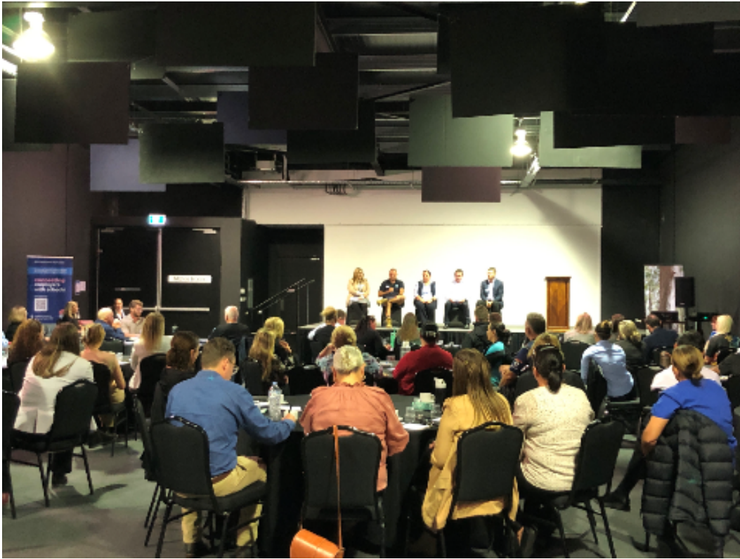
Industry and Schools Forum - Kempsey